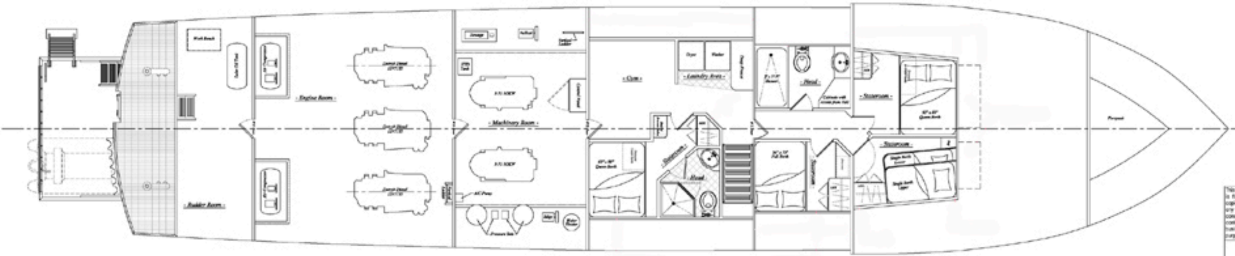
- Below Deck Plan - 1/4" = 1'-0"

This drawing is the exclusive property of Seacraft Shipyard Corporation and is furnished on a confidential basis. No portion of this drawing may be copied, traced, photographed, or in any other way be reproduced, nor may any item herein be used or manufactured as shown without the written consent of Seacraft Shipyard Corporation. The recipient of this information contained herein may not disclose the same to any other person or business firm, nor may he use such information except for the specific purpose intended.